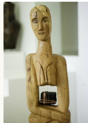
Holding Hope (Detail), 2006 Buche, Kupferdraht, Farbe 146 x 30 x 21,5 cm